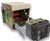
Masterpact NW Circuit Breaker