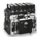
DA Circuit Breaker