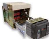
Masterpact NT-NW Circuit Breaker