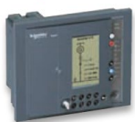
Sepam 60-80 series Protection Relay