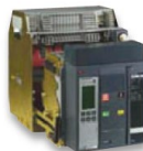
Masterpact NT-NW Circuit Breaker