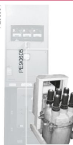
BVP 17 Circuit Breaker