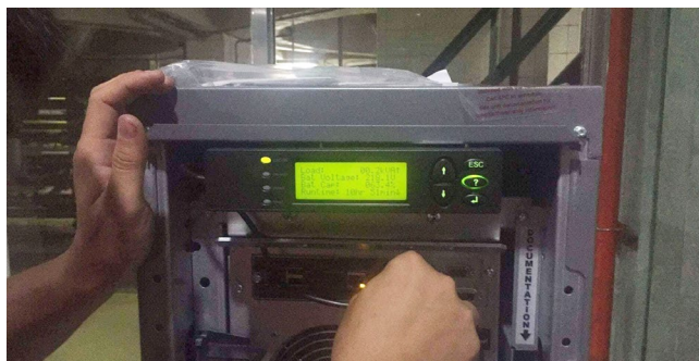
Galaxy 3500 UPS | San Miguel Brewery, San Fernando Plant, Pampanga

Let us be your service provider and strategic partner. Send us your inquiries.