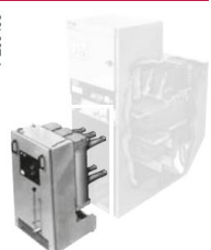
FG1-FG2 Circuit Breaker