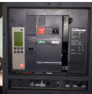
ECOFIT System | San Miguel Brewery, Polo Plant, Valenzuela City