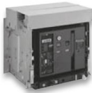
Masterpact M Circuit Breaker