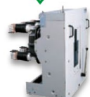
LF2-LF3-EVOLIS Circuit Breaker