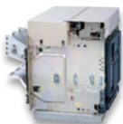
Masterpact NW Circuit Breaker